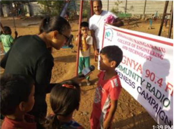
Awareness on Health Hazards of Junk Food in a Mall at Miyapur, Hyderabad publicized through Pragnya Radio