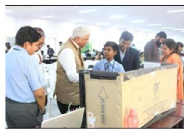
Ruedo - A National level Environment Fest in 23 Feb 2019