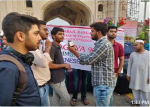
Awareness on water Harvesting in a gated community at Miyapur, Hyderabad publicized through Pragnya Radio